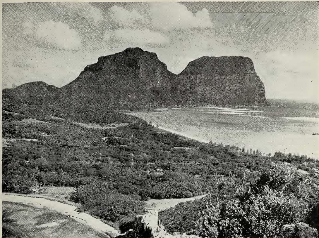
FIG. 3. A general view of Lord Howe Island from Malabar Hill. In centre, Mt. Lidgbird, at right Mt. Gower. The latter is 2,800 feet high.

very interesting features in regard to their distribution: the Calliphora hortona group, with bright orange knobs at base of wings, so typical to New Zealand and present in Sydney area (probably introduced), are absent on the island.